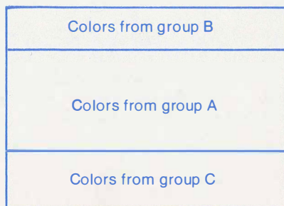
Figure 4 - Example of Using Zones

You'll notice 3 whites on the palette. Each is actually different internally, and each marks the beginning of the next color group. Several other colors appear in at least two of the groups, allowing you to give the appearance of a color crossing a zone vertically, while in fact you are using two different constructions of the same color. Color group A consists of colors 0 through 51. Color group B consists of 52 through 76, plus the standard Apple hi-res colors 4-7 (for lines). Color group C has colors 77 through 107, along with Apple hi-res colors 0-3.